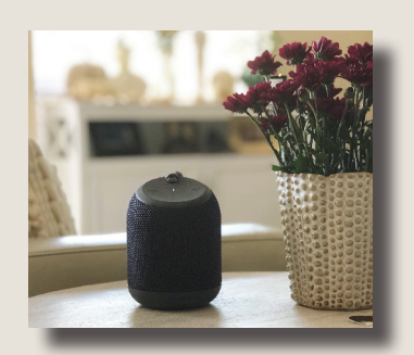
Bluetooth speakers can clarify and amplify volume to satisfy any media enthusiast.