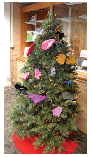
The tree in the Butler County REC lobby with hats and mittens donated by employees.

In addition, each year employees donate nonperishable food and hats, mittens, and scarves to those in need. The food is given to a food pantry in our service territory and the